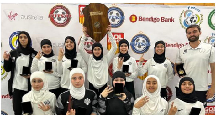
Around 300 students from Grade 3 to Grade 12 are taking part in ICB's futsal program.

"Every ICB student who competed at the Champions of Champions tournament should be proud of their efforts, and we look forward to kicking on to even greater heights in 2024."